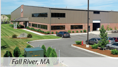
Fall River, MA