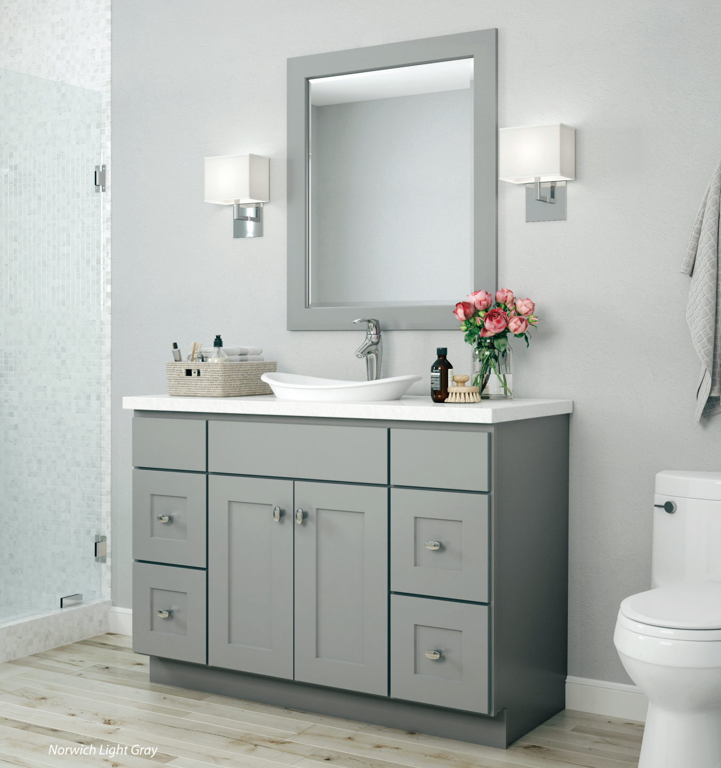
Norwich Light Gray